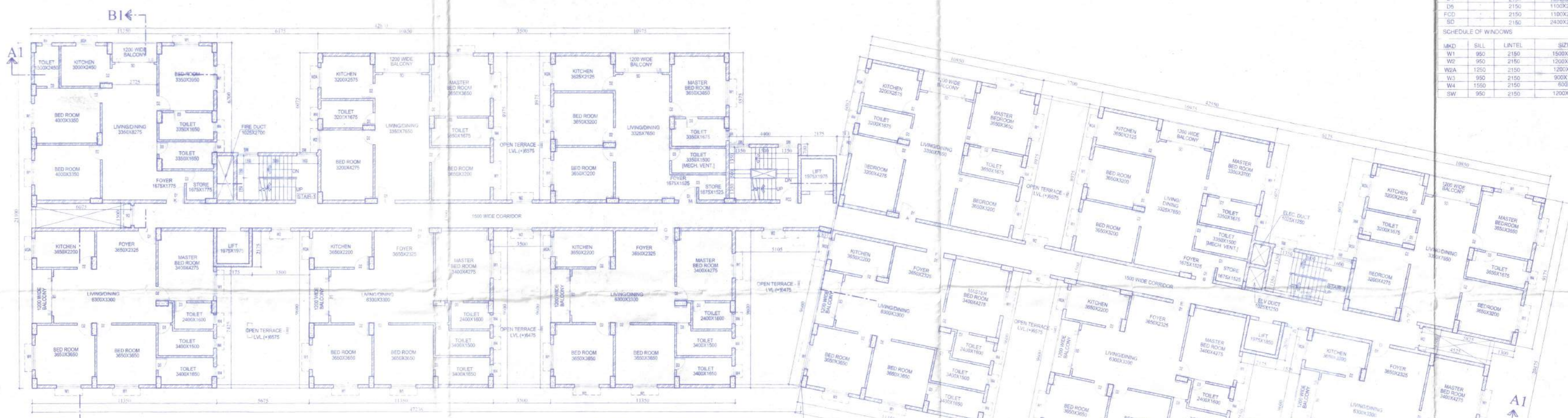
TYPICAL (2ND TO 5TH) FLOOR PLAN (TOWER-01) SCALE - 1:100

56 Christopher Road, 4th Floor, 4b The Ekta Hibiscus, Kolkata-700 046, P 033 2328 2264 E Mava2003@gmail.com, W Www.massandvoid.com